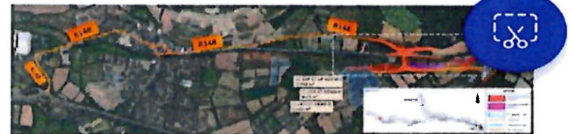
Figure 5-386 Depot siding construction compound and haulage route

The depot construction begins after new access road/OBG23A is completed. The access to local roads is from the new OBG23A and L5041 diversion, so no other alternative access is needed.